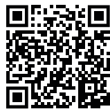
SIHL FUNDS PRO (MutualFund App.)