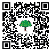
SIHL MONEYMAKER APPLICATION (Trading App.)